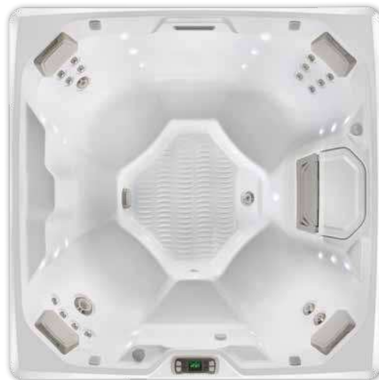
Beam shell shown in Alpine White

See detailed specifications for the Beam on page 36.