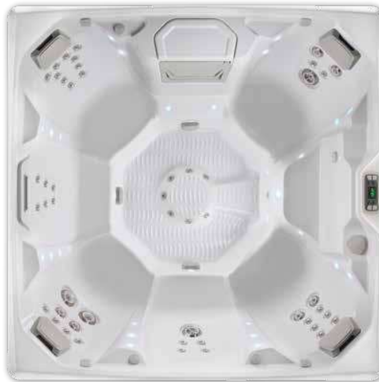
Pulse shell shown in Alpine White.