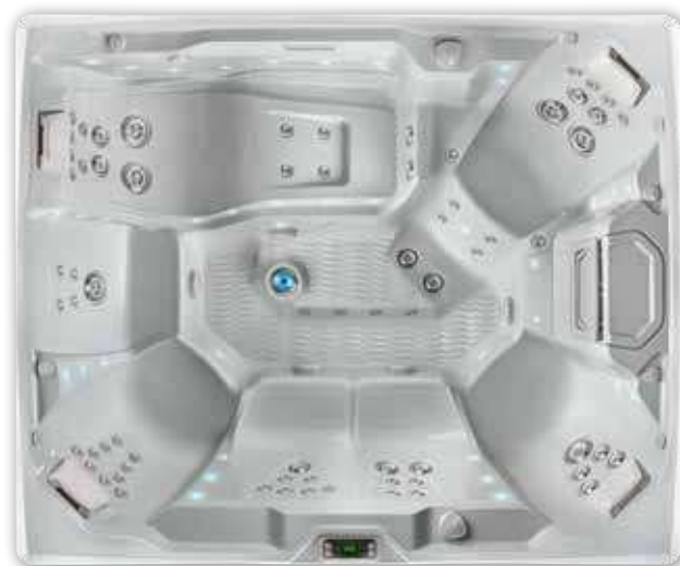
Prism™ - Seats 7