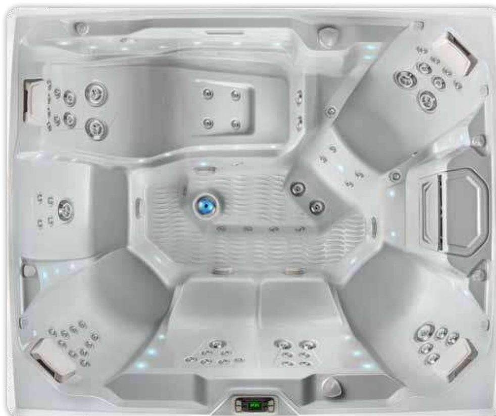
Prism shell shown in Ice Grey.

See detailed specifications for the Prism on page 36.