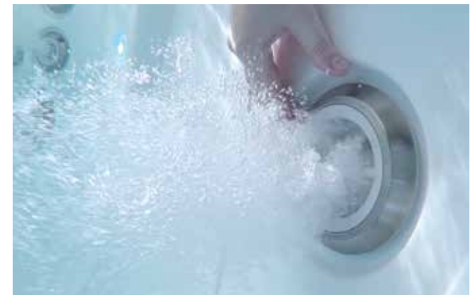
SmartJet lets you control the jet flow on and off to customise your experience.

A better massage starts with comfortable seats shaped to fit the body's natural contours. Combined with a spacious foot well and integrated pillows, Limelight Collection seats are positioned to relieve pressure and stress. With multi-level seating, there is a comfortable spot for everyone, and a just-right place for any body's specific need.