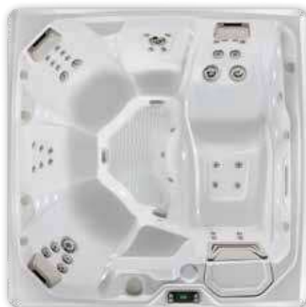
Flair™ - Seats 6