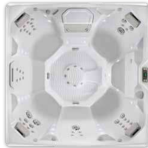
Pulse™ - Seats 7