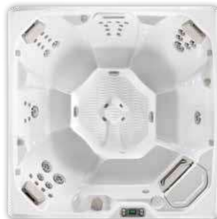
Flash™ - Seats 7