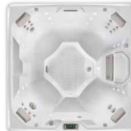
Beam™ - Seats 4