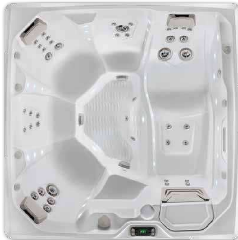
Flair shell shown in Alpine White.

See detailed specifications for the Flair on page 36.