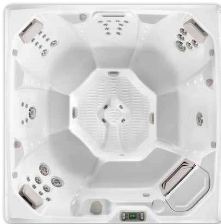
Flash shell shown in Alpine White.

See detailed specifications for the Flash on page 36.